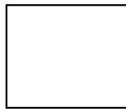
Jon Siu Seattle Department of Construction and Inspections