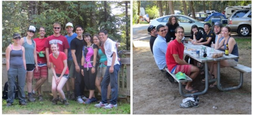
Portland and Seattle ASCE YMF members get together for a camping trip at Fort Steven's State Park outside of Astoria, Oregon.

The Portland and Seattle ASCE YMFs gathered at Fort Steven's State Park outside of Astoria, Oregon, for a weekend of camping. The group was composed of nine from Oregon and seven from Washington. Campers