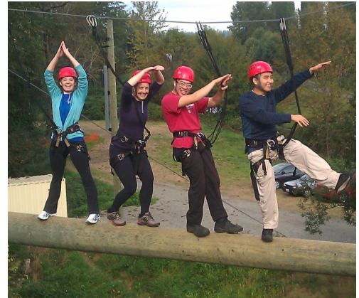
A scene from the YMF Fall Leadership Retreat at the ropes course in Woodinville, Washington.

Hello from the ASCE Seattle Section Younger Member Forum (YMF). Some of you may not realize, if you are a member of Seattle ASCE Section and are under 35, you are automatically a member of the Seattle Younger Member Forum as well! The YMF is set up to give "young" members an opportunity to volunteer in the local community, network with peers, work on professional development, and socialize with other young civil engineers. We have been busy doing all of those things!