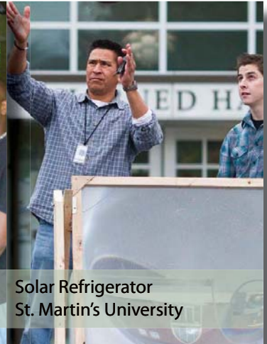
Solar Refrigerator St. Martin's University