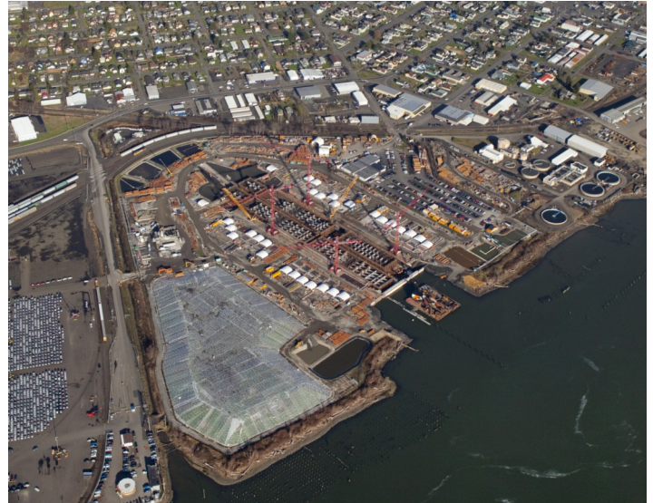
Aberdeen Pontoon Casting Facility