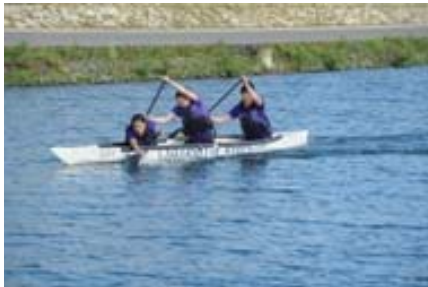
2008 UW Concrete Canoe Team Paddles in Montreal

After winning the regional contest, the UW team travelled to Montreal for the national contest, placing 17th overall.